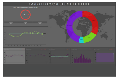
Get insight into user statistics with the SAO Software Monitoring Console