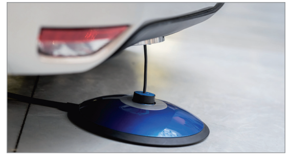
The Selfplug® solution comprises a ground connector of about 550cm in diameter with a vehicle plug fitted into the vehicle.

By employing Flux for modeling all magnetic issues, Gulplug engineers could make sure the plug was guided and inserted into the right spot to make it run. The Altair tool helped them to define the sizes and placement of the coils used inside the device which are required to create the electromagnetic force to guide the plug. All in all, Flux offers guidance on where to place the electromagnetic force, and how to develop the plug and fix it on the socket. The engineers still provide mockups and do tests to verify the Flux results. The software tool offers a comfortable way to make a model of the device, that can be easily shared with customers, car makers, and equipment suppliers before spending money on building a physical device or prototype.